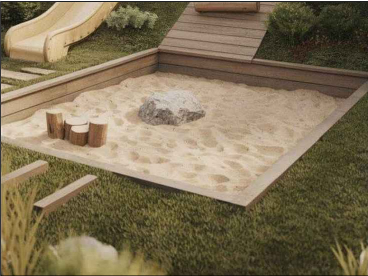
SANDBOX WITH CEDAR EDGING AND PLAY BOULDERS