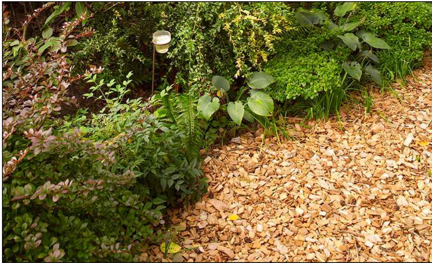
ENGINEERED WOOD FIBER AND PLANTINGS