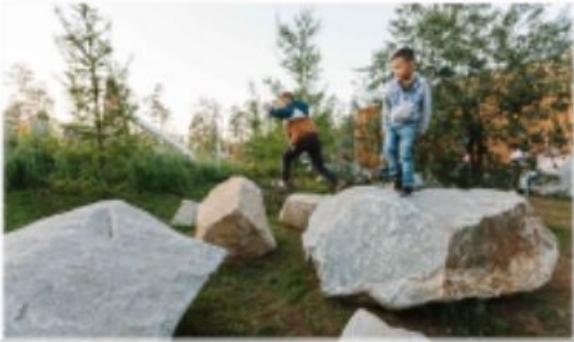
NATURAL PLAY BOULDERS