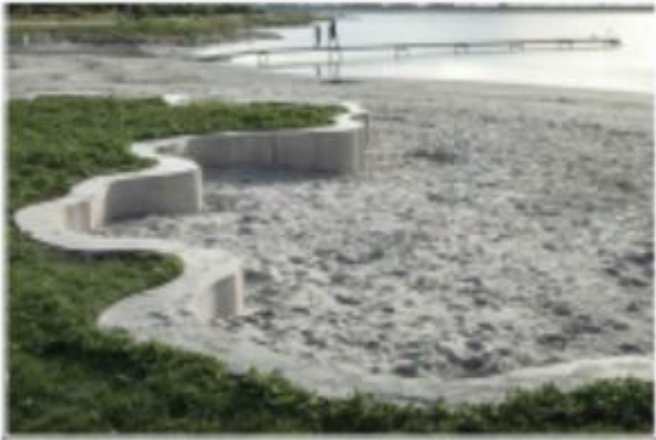
SUNKEN SAND AREA