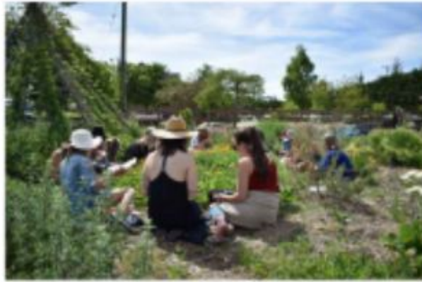
OUTDOOR LEARNING SPACES