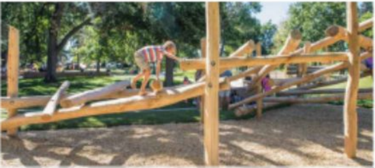
LOG CLIMBING STRUCTURES